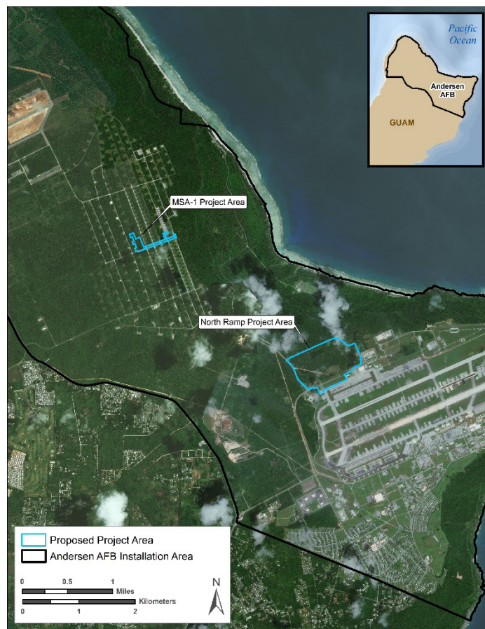
Figure 1: Overview of Locations on Andersen AFB Selected for Infrastructure Upgrades

A public review period is conducted to provide the public with the opportunity to review and comment on the Draft EIS, in compliance with NEPA. The Draft EIS contains information on the action being proposed, and presents potential impacts from implementing the Proposed Action and alternatives. During the public review period, the DAF actively requests substantive public comments on topics addressed in the Draft EIS for consideration in the Final EIS. See the timeline on the back of this brochure for additional information regarding steps in the EIS process.