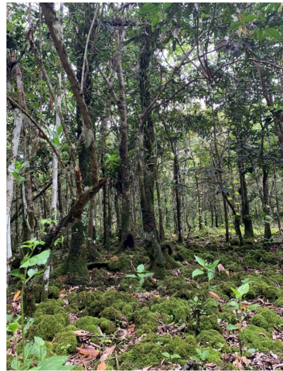
Figure 4: Limestone Degraded Forest with Native Trees in the North Ramp Project Area