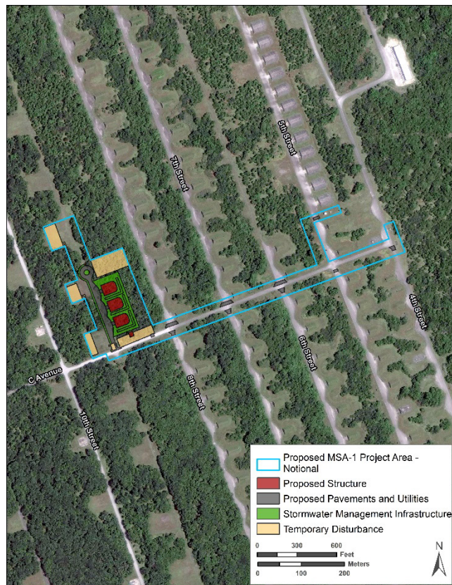
Figure 3: Proposed MSA-1 Infrastructure Upgrades